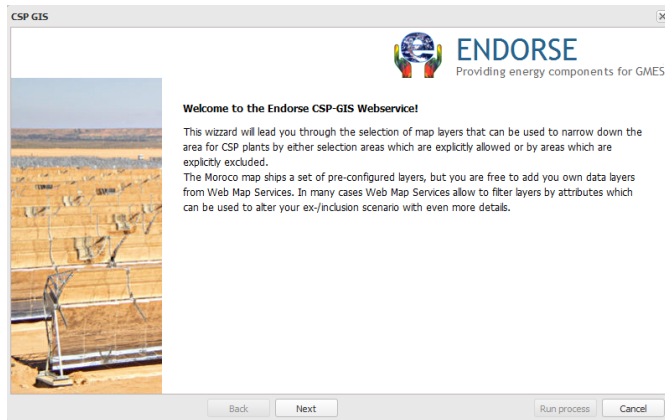
Welcome dialog with service description